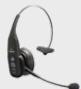
■ 95ACC0002 Bluetooth® Headset VX1 B350-XT